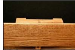
Center Divider #146