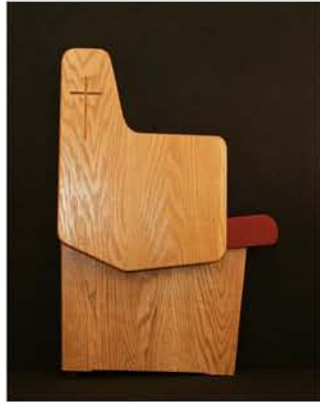
PEW END #11