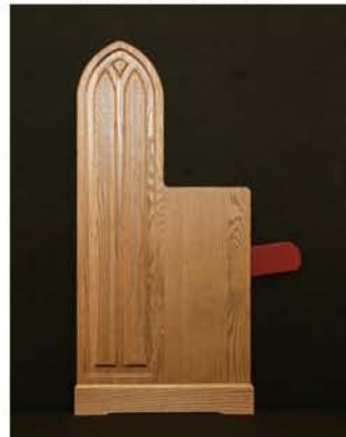
PEW END #44-B