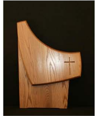
PEW END #14