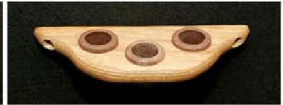
Cup holder #3C