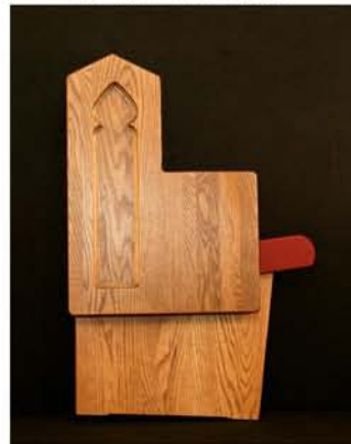
PEW END #24