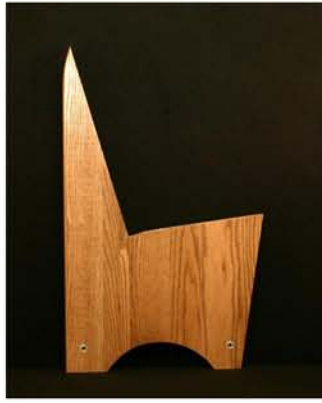
Pew Center Support

Davis Furniture Company pew supports are designed to be aesthetically pleasing, while offering maximum support to the pew body. All Davis Furniture Company pew supports feature a cutout at the base of the support to allow for two points of contact,* eliminating any opportunity for the pews to rock over time. Davis Furniture Company also uses two anchors on all anchored supports, giving our pews the most solid anchoring available.*