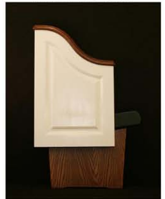
PEW END #28