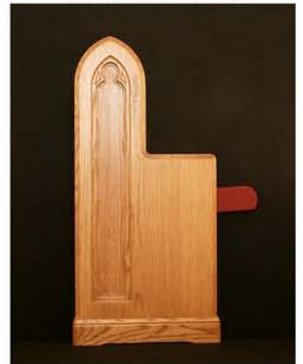
PEW END #44-C