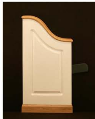
PEW END #48