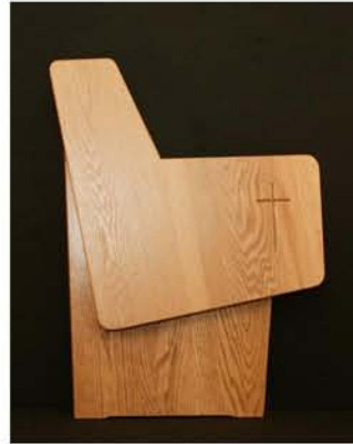
PEW END #12