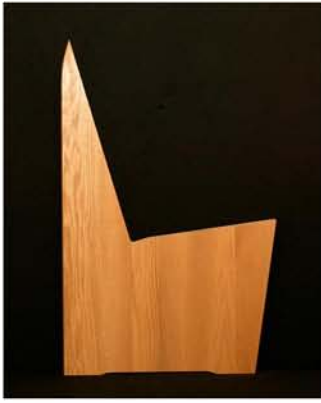
Pew End Support