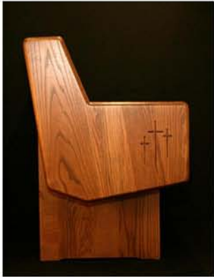
PEW END #10

Davis Furniture Company provides a wide array of standard pew ends, and endless possibilities with our custom pew end design capabilities. The following is a sampling of our most popular standard pew ends.