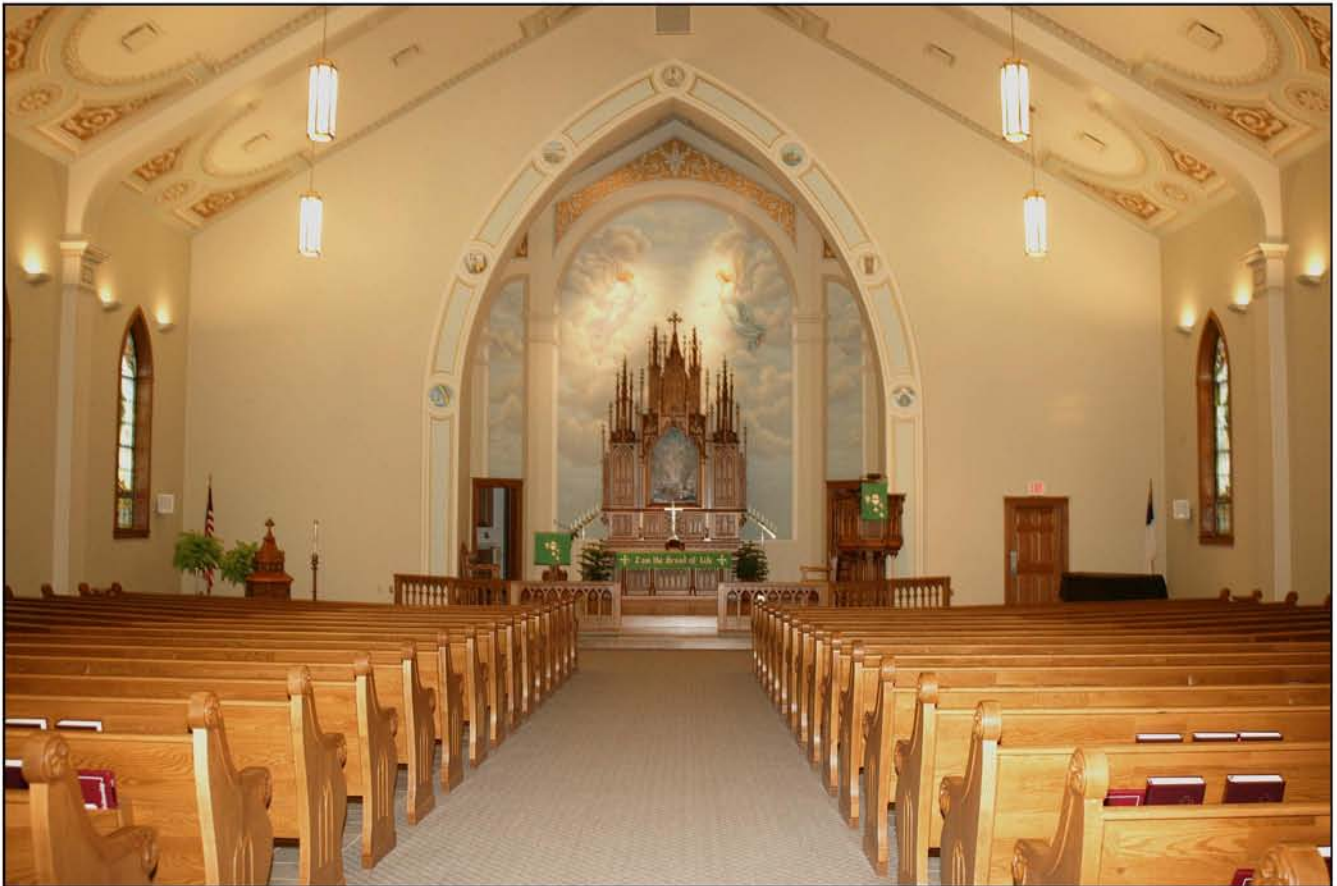
St. Paul Lutheran Church, Bonduel, WI