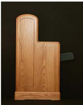
PEW END #55