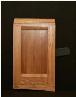
PEW END #38