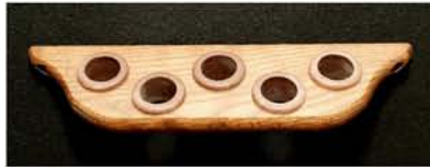
Cup holder #5C

Communion cup holders can be purchased separately and are designed for easy installation.