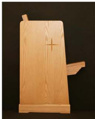
PEW END #39