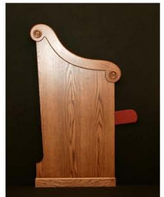
PEW END #50