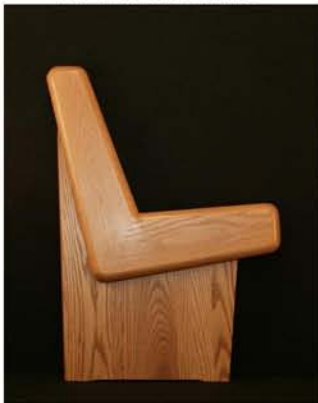
PEW END #16