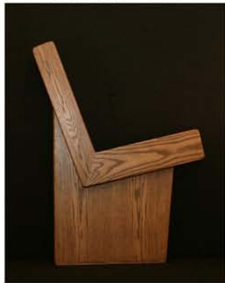
PEW END #17