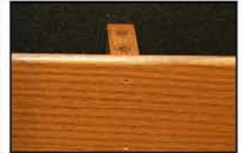
Center Divider #147

Standard bookracks (back mounted models) will accommodate four books and available options include built-in pencil, card, and communion cup holders. Under-seat mounted bookracks (generally used under the seats of the front rows of pews) are another option. Custom sizes and styles are always available upon request or as required by the pew.