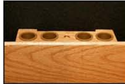
Center Divider #145