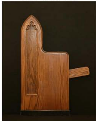
PEW END #44-A