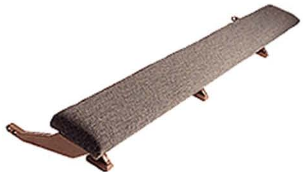
Davis Furniture Company